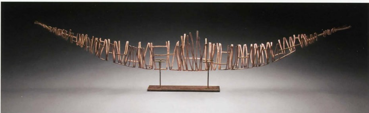
Copper Rib Boat . Solid hand-hammered copper. 60 x 8 x 5 in.