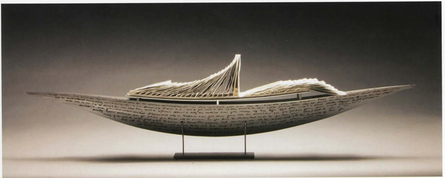
Waves of Immigration. Steel boat with hand made book, which has vintage images of child immigrants printed on Arches Watercolor paper. Crinkled vellum is used between each photo image. The hand-sewn book nestles into the boat. There is non-legible writing on the boat's surface to connote the idea of one's personal journal "inviting a narrative, but not spelling it out." 56 x 12 x 8 in.