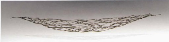
Nest Boat. Steel rods. A skeletal form in the shape of a boat – it evokes the feeling of a bird's nest. 58 x 8 x 6 in.