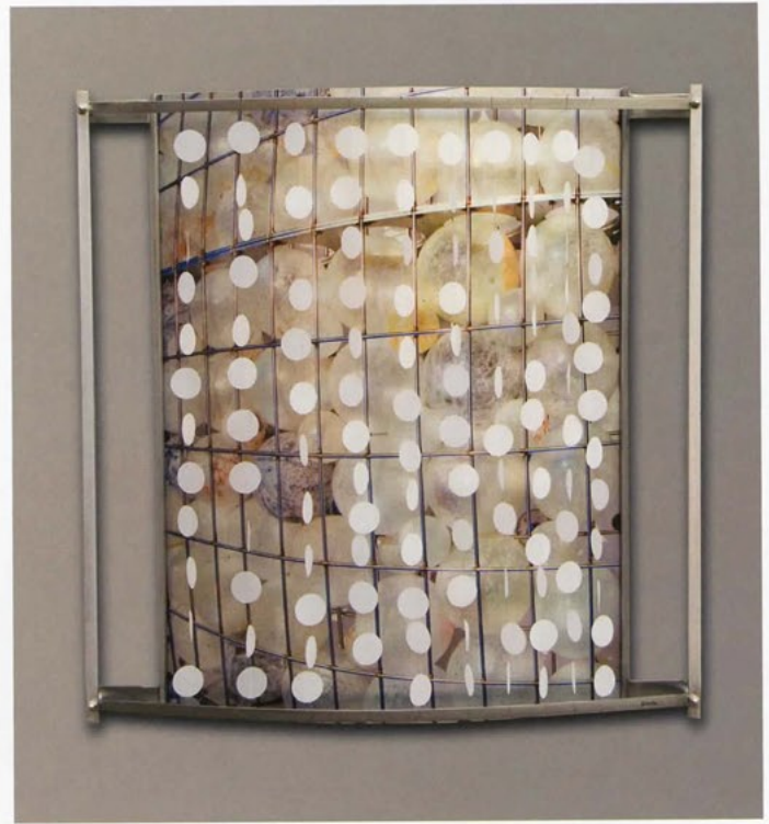
Spheres and Dots. Digital photo image mounted on aluminum. Vellum and nylon thread create the scrim dots. 22 x 30 x 4 in.